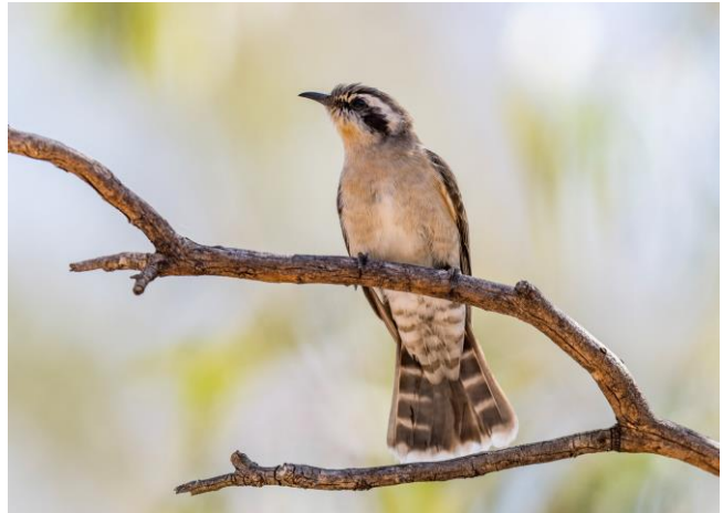
Black-eared Cuckoo

Day 3. Saturday 8 June 2024. Boulia to Birdsville (380 km). Today we drive south on the through the Channel Country. Our destination is Birdsville, one of Queensland's most famous Outback towns. We will stop along the way at river crossings to look for Black-eared Cuckoo , Black Honeyeater , Brown and Rufous Songlark , and nomadic flocks of Cockatiel . On arrival at Birdsville we will check into our accommodation and explore the town. Accommodation: Birdsville (en suite rooms). Meals included: B, L, D.