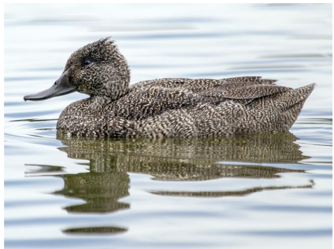
Freckled Duck

Day 8. Thursday 13 June 2024. Bowra Station. We'll have a full day to explore the range of ecotones here and will explore the various trails in order to have the best chance of the harder to find specialties. If water is present at any of the waterholes along the creek-lines we may find a range of water birds like Black-fronted Dotterel, White-necked Heron, Black-tailed Native-hen, Plumed Whistling-duck or even Freckled Duck . Honeyeaters regularly come in to drink, especially in the morning and late afternoon, and we should see White-plumed, Striped, Black-chinned, Singing, Spiny-cheeked and Blue-faced Honeyeaters. Bourke's Parrot is a regular visitor and a quiet sit at one of the waterholes on dusk may be rewarding, as they come in to drink quite late in the evening. Some of the more extensive patches of mulga woodland on the station have Hall's Babbler, Chestnut-breasted Quail-thrush and White-browed Treecreeper present, and the quail-thrush in particular is best attempted early morning as the males sing to advertise territory. In the evening we'll try a bit of spotlighting, looking for Spotted Nightjar, Tawny Frogmouth and Australian Boobook , as well as reptiles like Marbled Velvet Gecko, Red-naped Snake and Gidgee Skink . Accommodation: Cunnamulla (en suite rooms) Meals included: B, L, D