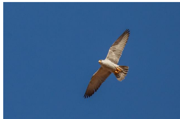
Grey Falcon

Day 6. Tuesday 11 June 2024. Windorah to Quilpie (330 km). After a pre-breakfast look along Cooper Creek, we'll leave Windorah and head south, stopping en route for birds and wildlife along the way. We may see our Australian Bustards today, as well as chances of mixed flocks of White-browed and Masked Woodswallows, White-winged Triller, Rufous Songlark, Blue Bonnet, Mulga Parrot, Spotted Bowerbird, Red-browed Pardalote and hopefully if there has been recent rain – Pied and Black Honeyeaters in flowering Eremophila shrubs. Raptors should be well-represented, with Black Falcon, Black-breasted Buzzard, Spotted Harrier, Little Eagle, Wedge-tailed Eagle, Black and Whistling Kites and the ever-present chance of Grey Falcon or even Letter-winged Kite. We will stop at the tiny Outback village of Eromanga with its amazing fossil museum. The town lies on Cretaceous Eromanga Sea and fossils of dinosaurs and more recent megafauna have been