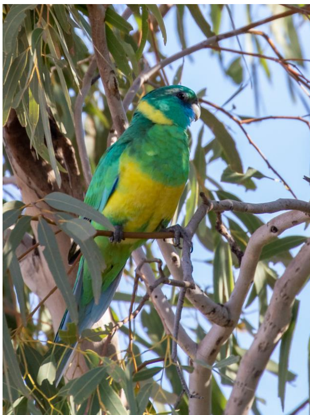
Cloncurry Ringneck

Day 1. Thursday 6 June 2024. Arrive Mount Isa. Today has been set aside as an arrival day. Meet at 19:00 for a group welcome dinner, meet your guides and chat about the details for the tour. Accommodation: Mt Isa (en suite rooms). Meals included: D