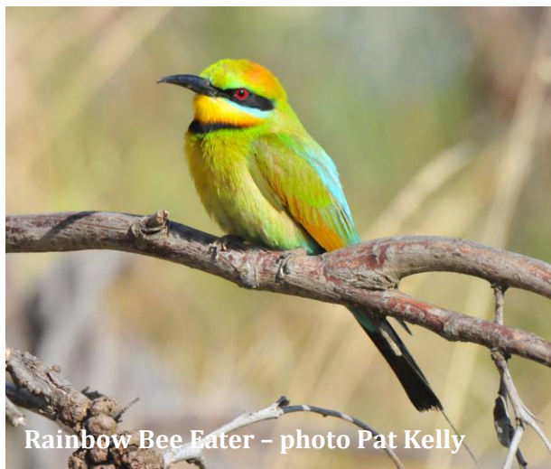
Rainbow Bee Eater

Day 10: Saturday 15 June 2024. Blackall to Longreach (250 km). We will take the less-travelled route to Longreach, stopping at Idalia National Park, west of Blackall. This area of sandstone gorges and mulga woodland is home to seven species of macropod including Yellow-footed Rock-wallaby and Black-striped Wallaby . After rain, the park is vibrant with wildflowers. If there's time, we will visit the Outer Barcoo Interpretive Centre to look at the display of fossils collected from the Isisford area. We'll endeavour to reach Longreach early enough to do some birding