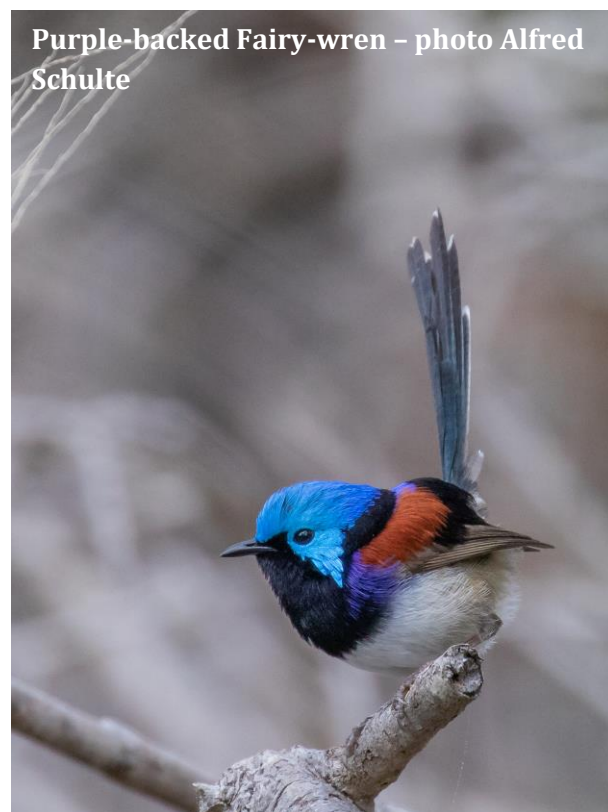
Purple-backed Fairy-wren

Day 4. Sunday 9 June 2024. Birdsville area. We'll have a full day to explore this area, with excursions out to the west and north to look for a few star specials of the region. To the west is the mighty Simpson Desert with its enormous red sand dunes, and here we'll look for Eyrean Grasswren in the canegrass amongst the swales. This is a charismatic and active species, however we will need to sit quietly amongst their chosen habitat for the best chances of a look. Out on the lignum flats to the north of Birdsville we'll have a try for Grey Grasswren , an extremely elusive bird that is entirely restricted to the lignum floodplains of the lower Eyrean basin of the corner country where NSW, QLD & SA meet. Mammals we should see include Red Kangaroo , Western Grey Kangaroo and Common Wallaroo (Euro) . At night we can head out with spotlights in hand to look for night birds such as Spotted Nightjar , Australian Owllet-nightjar and Australian Boobook , and for