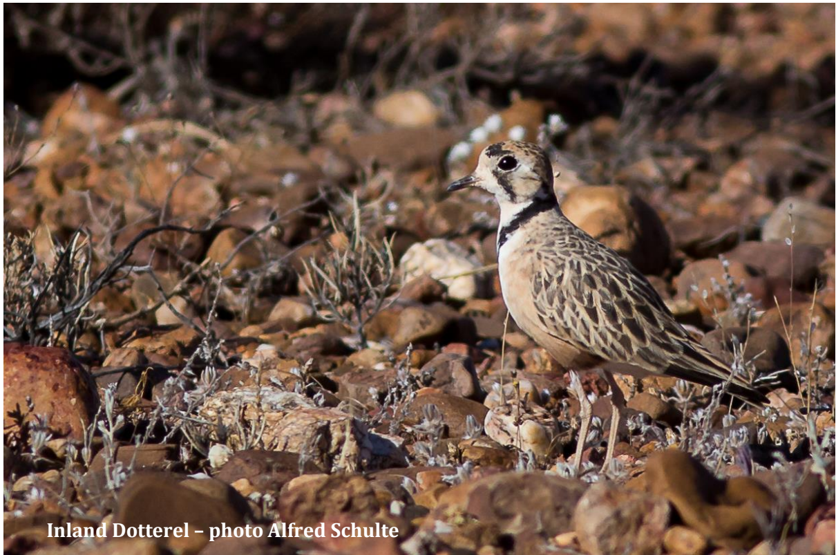
Inland Dotterel

Birds and Wildlife of the Remote Outback 6 - 15 June 2024