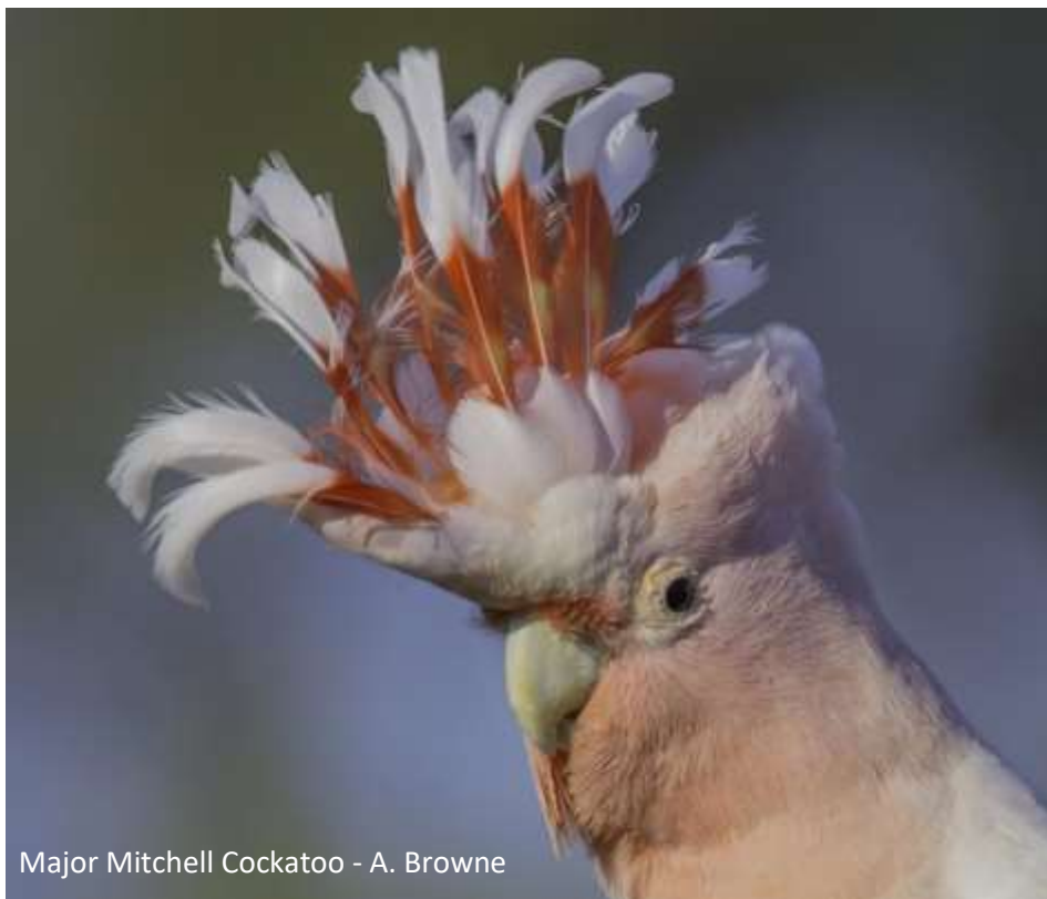
Major Mitchell Cockatoo

The 'Red Centre' is an extraordinary landscape of desert plains, ancient weathered mountain ranges, rocky gorges, and some of Aboriginal Australia's most sacred sites. This tour has been designed to maximise the chances of experiencing the birds and wildlife of the area around Alice Springs and the West Macdonnell Ranges to Ghan (which takes its name from the rail journey that operates between Adelaide-Alice Springs and Darwin, originally known as the Afghan Express after the 19 th century camel drivers who helped to explore the country's remote interior). Iconic 'Outback' dry country bird species we will be searching for include Dusky Grasswren, Rufous-crowned Emu-wren, Inland Dotterel, and parrots such as Major Mitchell's Cockatoo, Cockatiel and Budgerigar. These areas are also great places to find macropods such as Black-flanked Rock-wallaby and Euro as well as Dingo. This tour has been designed to precede our popular Top End-Darwin-Kununurra tour, which in turn adjoins our Kimberley to Broome and Broome-Dampier Peninsula tours, which allows for maximum flexibility in exploring this remote and little-explored area of Outback Australia.