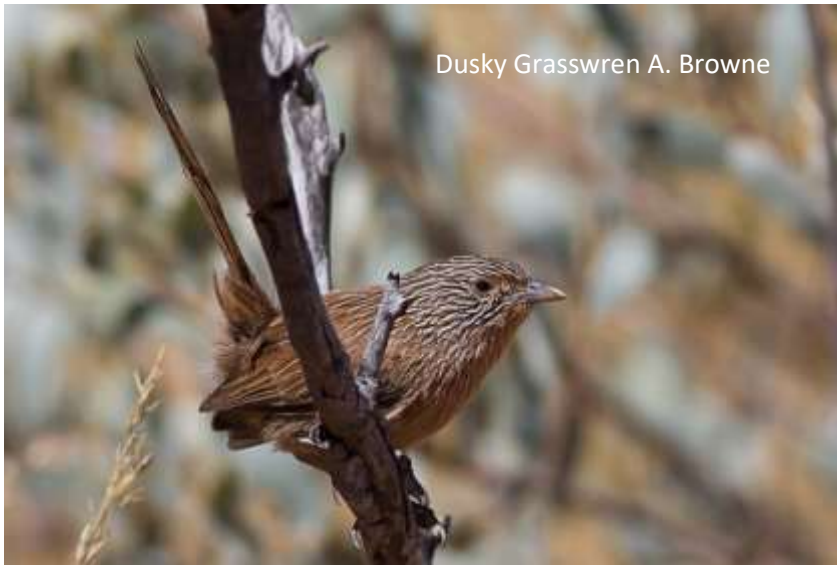
Dusky Grasswren A. Browne

Alice Springs is an excellent base from which to access a wonderful diversity of birds typical of Australia's dry country. There are a range of 'special' species to this area and in the days to come we will endeavour to track a good number of these down. We will have an early start and venture into spinifex country in search of the