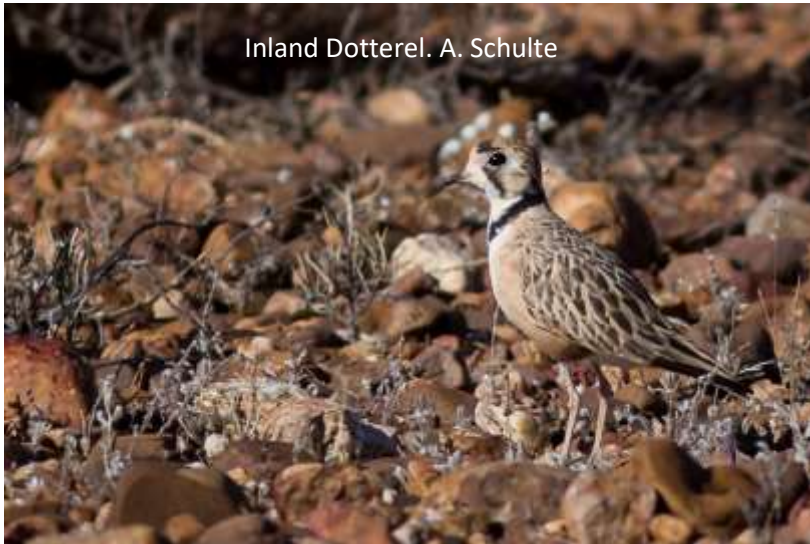
Inland Dotterel. A. Schulte

This morning we will make an early start, leaving Alice Springs and heading southwards towards Eildunda. White-browed Treecreeper, Grey Honeyeater and a variety of thornbills (Slaty-backed, Inland & Chestnut-rumped Thornbill) are all possible in the mulga en route. This afternoon we will bird in the stony plains in the area (known as gibber plains after the Aboriginal word for stone). These sparse and barren plains might look 'empty' but they are home to some very interesting bird species including Cinnamon Quail-thrush, Chiming Wedgebill and the amazing Inland Dotterel.