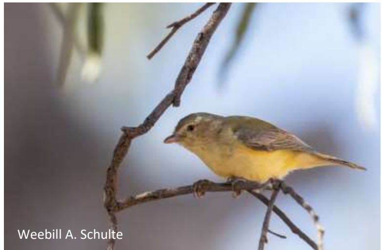
Weebill A. Schulte

This morning we will take a pre-dawn drive out to the gibber plains in search of species we may have missed yesterday. After breakfast, we will then journey northwards, likely stopping at an area of waterholes off the Stuart Highway. This fruitful area is usually home to a few patches of water and these, along with the fabled red river gums, attract a range of species. This is an excellent area for Cockatoos and parrots, and we may well see Major Mitchell's (Pink) Cockatoo, Little Corella, Budgerigar, Galah and Cockatiel! We will return to Alice Springs late afternoon.