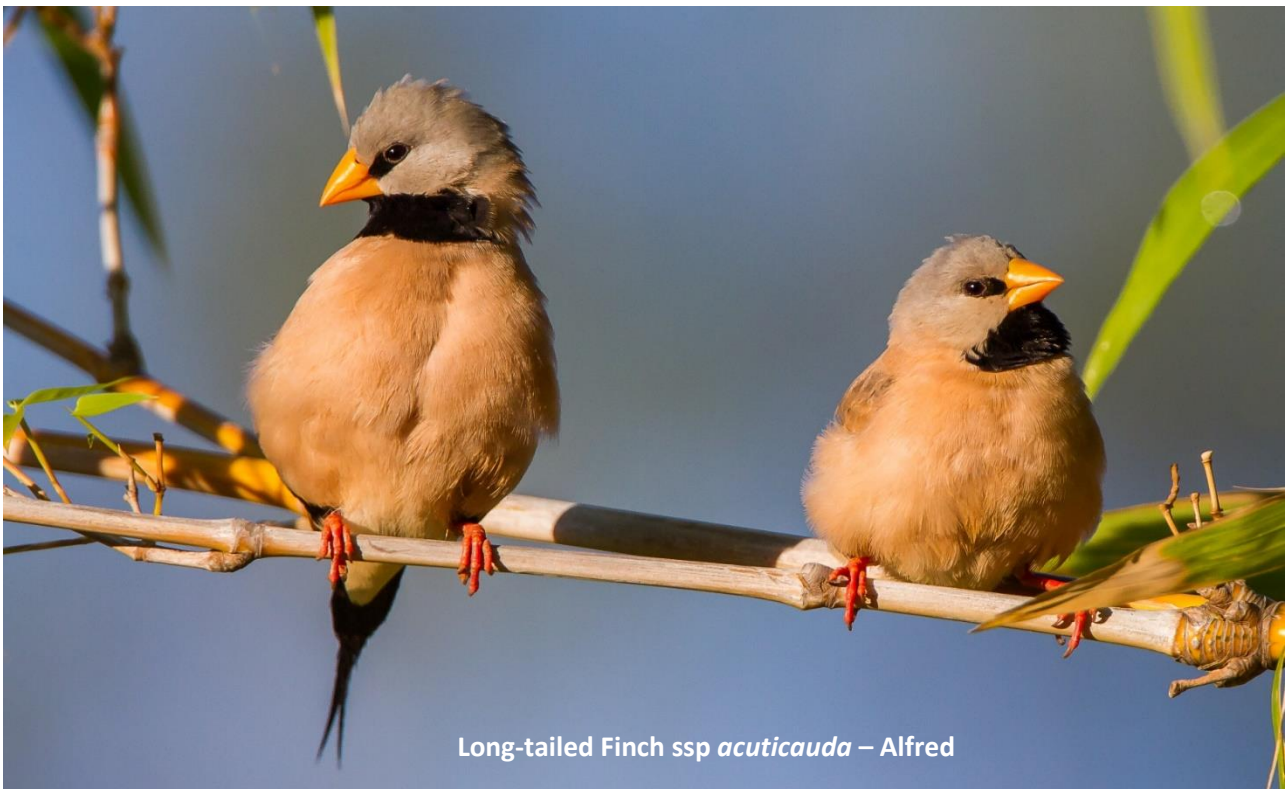
Long-tailed Finch ssp acuticauda – Alfred

This small group tour has been designed to follow on from our popular Top End to Eastern Kimberley tour (28 July-5 August 2024) and our Kimberley Kununurra to Broome tour 4-14 August 2024 which allows for maximum flexibility in exploring this remote and little-explored area of Outback North-Western Australia.