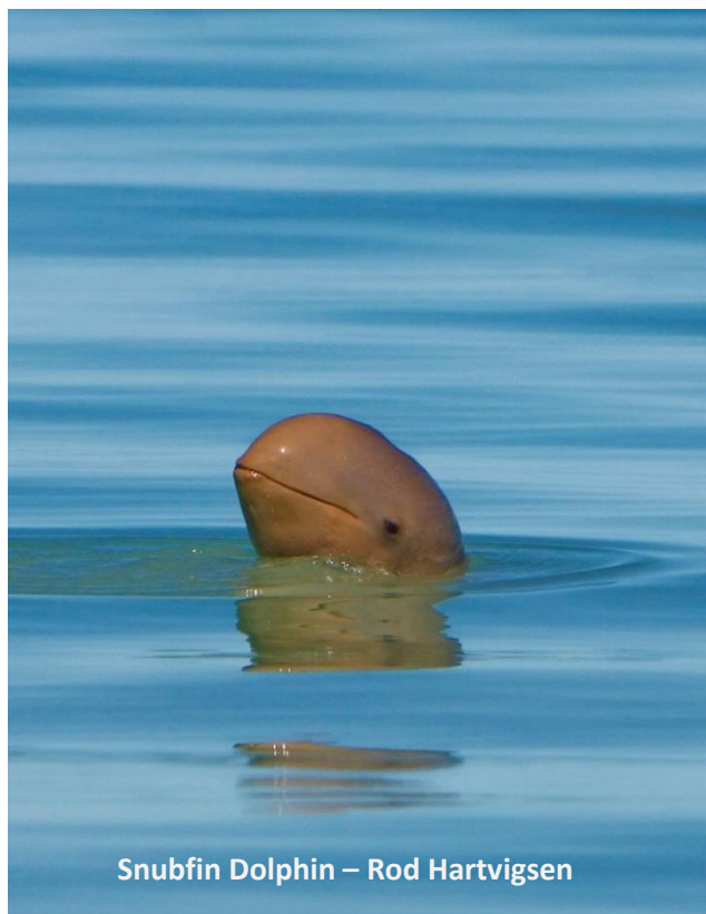
Snubfin Dolphin

Accommodation: Broome (hotel room with en suite) as for last night. Meals Included: B, L, D.