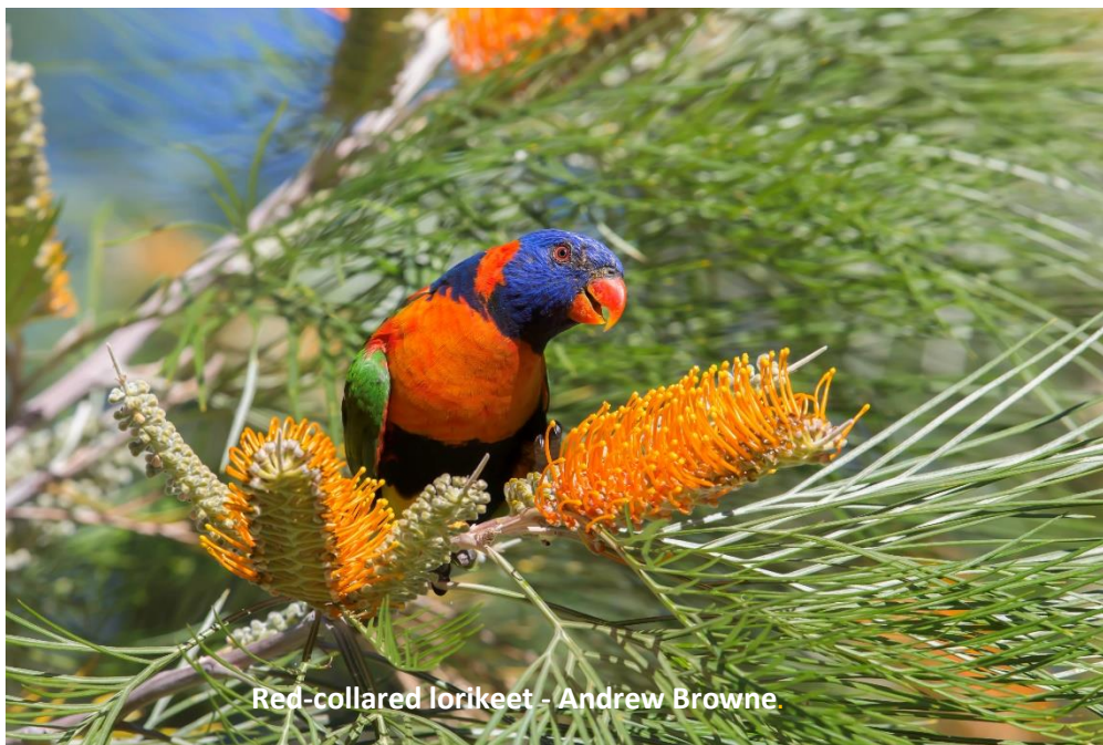
Red-collared lorikeet - Andrew Browne

Accommodation: Dampier Peninsula (Glamping en suite Safari Tent). Meals Included: B, L, D.