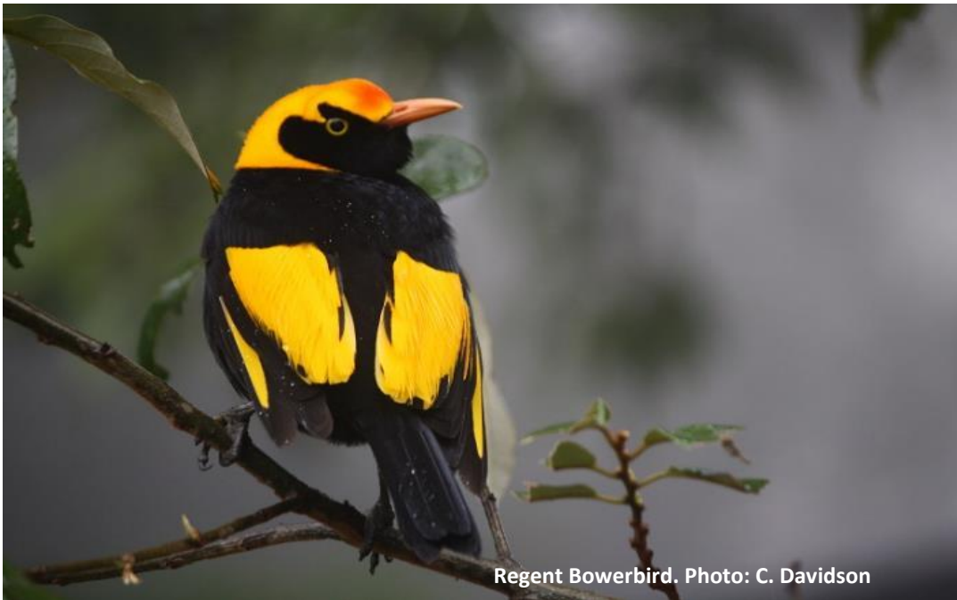
Regent Bowerbird.

This tour showcases the very best of south-eastern Queensland's wildlife, with chances to see a large number of birds, mammals and reptiles. We also visit some stunningly scenic locations which include iconic places such as O'Reilly's in Lamington National Park, and other areas renowned for their natural values but are not on many tour itineraries, such as the Bunya Mountains and the Great Sandy National Park.