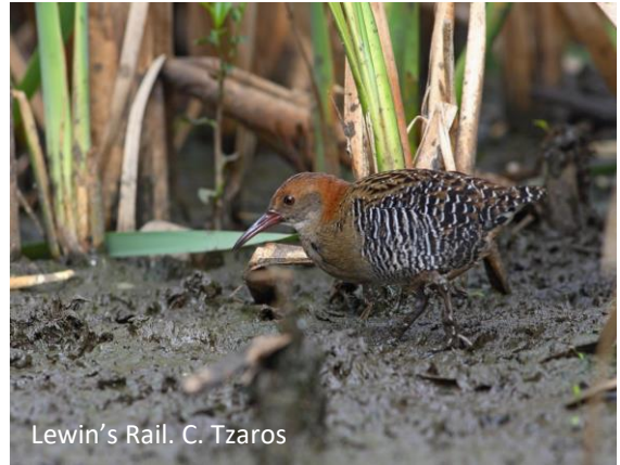
Lewin's Rail. C. Tzaros

Accommodation: Rainbow Beach. Meals Included: B, L, D.