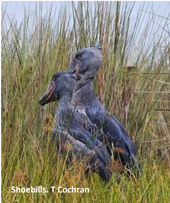
Shoebills. T Cochran

After an early breakfast, we will travel to some nearby wetlands on the shores of Lake Victoria. This is one of