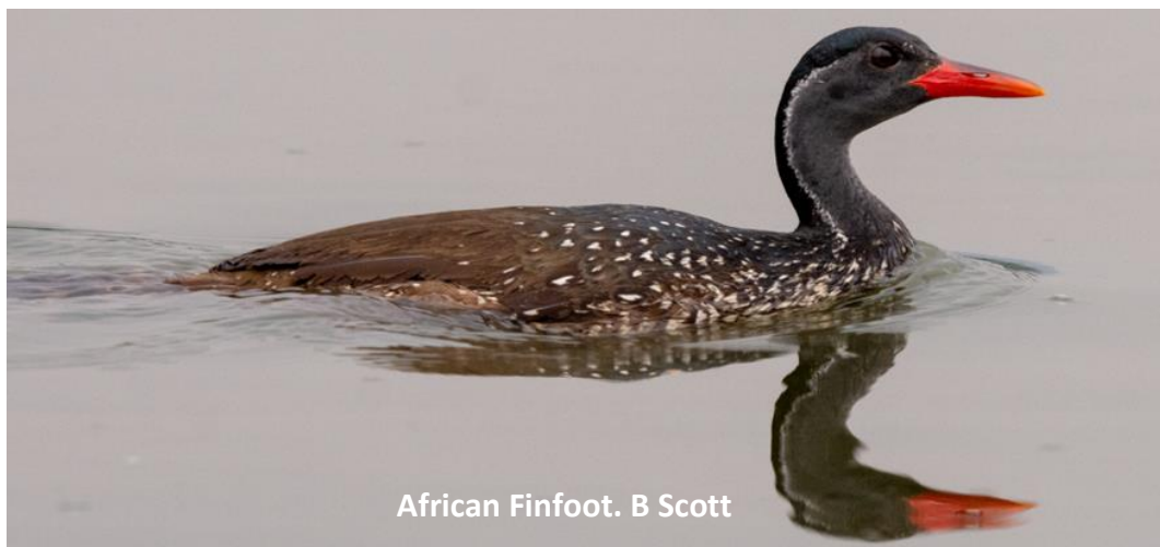
African Finfoot. B Scott

Day 14. Boat ride Lake Mburo NP. This morning after breakfast, we will have a morning game drive in the National Park looking for mammals including Plains Zebra, Impala, Eland, Topi and African Buffalo. We will also look for birds like Trilling and Tabora Cisticola, Crested, Spot-flanked, Black-collared and Red-faced Barbet and Red-necked Spurrowl. In the afternoon, we will have a boat trip looking for bird specialties and