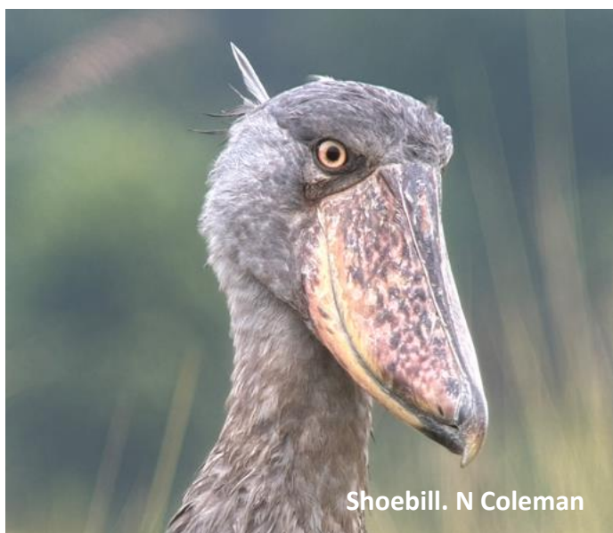
Shoebill. N Coleman

Uganda is a landlocked country comprising a mix of savannas, mountains and lakes. It lies within the Nile River basin and has an equatorial climate. The southern part of the country includes a substantial part of Lake Victoria (which it shares with Kenya and Tanzania). The Ruwenzori Mountains, which it shares with the Democratic Republic of the Congo, are home to most of the remaining endangered Mountain Gorilla population. It is also a stronghold for the highly sought-after Shoebill which is included in the IUCN Red List of Threatened Species 2018 . The variety of habitats makes it one of the most exciting bird and mammal viewing destinations in the world.