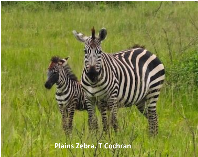
Plains Zebra. T Cochran

Day 13. Bwindi to Lake Mburo NP. Lake Mburo National Park is a gem. Although it is just 370 sq km in size, its landscapes are varied and even a short drive is alive with interest and colour. It is the only National Park in Uganda to contain Impala and the only one in the rift region to host Plains Zebra and Eland. In Uganda, Topi are only found in Lake Mburo and Queen Elizabeth National Parks. Other common wildlife species include Common Warthog, African Buffalo, Oribi and Defassa Waterbuck.