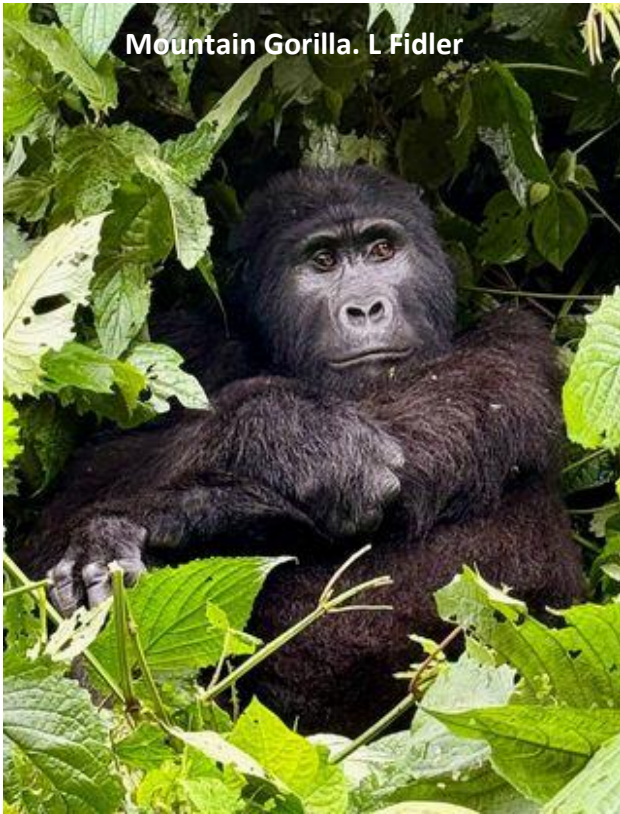
Mountain Gorilla. L Fidler

community. This exclusive experience is a real privilege, as group sizes are limited to one group of trekkers for each gorilla group per day, which make viewing permits almost as scarce as the gorillas! Tracking can be a challenging activity involving a certain amount of physical fitness as it can take up to 8 hours of walking through thick jungle in the wilderness in search of these gentle giants. On occasions the Gorillas prove elusive, but often can be found within an hour by the expert local tracker guides. It is a very emotionally moving once in a lifetime experience to stare into the eyes of these gentle giants and watch them play and go about their daily activities. Each encounter with the gorillas is different and has its own rewards, but you are likely to enjoy the close view of adults feeding, grooming, and resting as the young frolic and swing from vines in a delightfully playful display. On our return we will be issued with a certificate and provided with a chance to purchase a pictorial laminated sheet of the family that we have been tracking, with all proceeds going towards the conservation of this species and the protection of the forests in which they live. Accommodation: Lodge in Buhoma, adjacent to Bwindi Impenetrable NP (en suite rooms) as for last night. Meals: B, L, D.