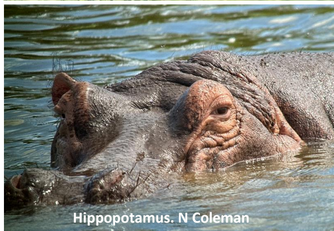
Hippopotamus.