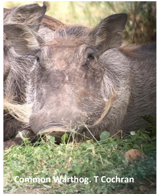
Common Warthog. T Cochran

Common conspicuous birds we will encounter on our journey to Lake Mburo include Crested Francolin, Emerald Spotted Wood Dove, Brown Parrot, Bare-faced Go-away Bird, Blue-napped Mousebird, Lilac-breasted Roller, Green Wood hoopoe, Common Scimitar Bill, African Grey Hornbill, Spot-flanked Barbet, Nubian Woodpecker, Trilling Cisticola, Yellow-breasted Apalis, Northern Black Tit, Chin-spot Batis, Greater Blue-eared Starling, and Marico Sunbird. The woodland in the immediate vicinity of the camp also supports many of these widespread species. Tonight, we will stay in an unfenced tented camp where hot water is delivered for your shower and where you are escorted to and from your cabins after dark by the wonderful staff – a truly amazing experience! Accommodation: Tented Camp (en suite tents) in Lake Mburo National Park. Meals: B, L, D.