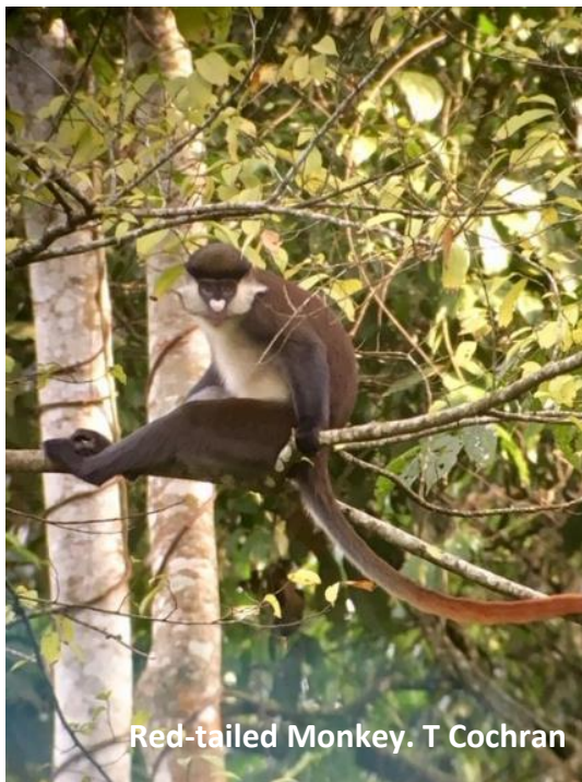
Red-tailed Monkey. T Cochran

Accommodation: B&B near Kibale NP. (en suite rooms). Meals: B, L, D.