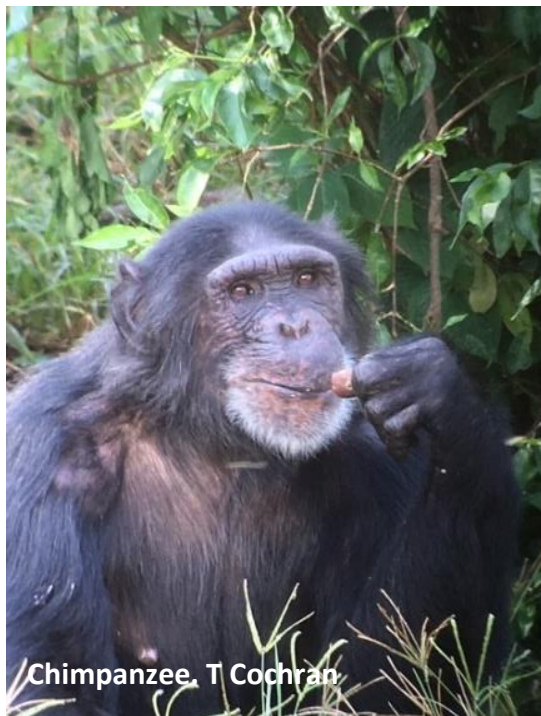
Chimpanzee. T Cochran

Day 7. Kibale Forest National Park: Chimpanzee tracking and birding. After an early breakfast we will drive to Kibale National Park. Here we will spend up to several hours tracking and observing wild Chimps on foot with our expert local guides who personally know the troop members and who will interpret their behaviour. Kibale forest is home to 13 primates. We will also be searching for key bird species here including the highly sought-after Green-breasted Pitta and Narina Trogon. We will spend the afternoon birding in the nearby forest trails and around our lodge for bird species that are hard to find elsewhere including the Speckle-breasted Woodpecker, Cabanis's Greenbul and Joyful Greenbul as well as White-spotted Flufftail, Dusky and Olive Long-tailed Cuckoos, Lesser Honey guide, Blue-shouldered Robin-Chat, White-chinned Prinia, Grey Apalis, Olive-green Camaroptera and White-collared Oliveback. We will have a delicious home-cooked meal at our B&B this evening. Accommodation: B&B near Kibale National Park. (en suite rooms) as for last night. Meals: B, L, D.