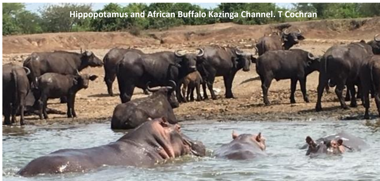
Hippopotamus and African Buffalo Kazinga Channel. T Cochran

Day 9. Queen Elizabeth NP: Birding and afternoon boat cruise. This morning's game drive takes us through a productive area of grassy plains, which support large flocks of a variety of stork species including the Spectacular Saddle-billed and Woolly-necked Storks. Other species include the Bateleur, Grey Kestrel, Lappet-faced, Ruppell's Griffon, White-backed and Palm-nut Vultures, African Crake, Black Coucal, Common Button-quail, Harlequin and Black-rumped Quails, Red-necked Francolin, Rufous-naped and Flappet Larks. Mammals we will look for include Uganda Kob, African Lion, Common Warthog, Bush Buck, Defassa Waterbuck, Spotted Hyena, Leopard, and many others. In the afternoon we take a launch tour of the Kazinga Channel, which is a natural magnet for herds of Bush Elephant, Giant Forest Hog, African Buffalo, Monitor lizard, crocodiles and abundant Hippopotamuses.