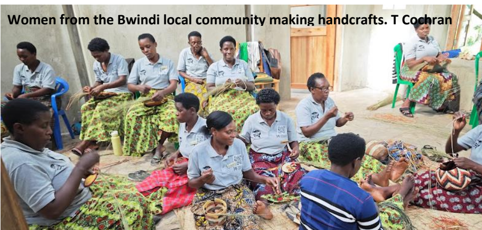
Women from the Bwindi local community making handcrafts. T Cochran

We will then visit a community-run craft outlet where we can watch the local women make handcrafts for sale and meet members of the local community who are working on different aspects of conservation of Mountain Gorillas at a grass roots level. Accommodation: Lodge in Buhoma adjacent to Bwindi Impenetrable NP (en suite rooms) as for last night. Meals: B, L, D.