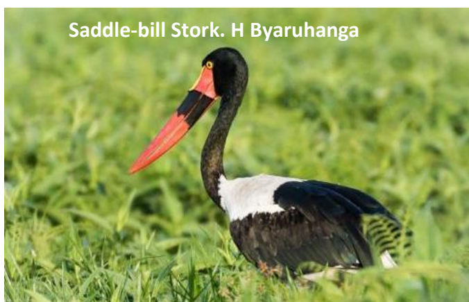
Saddle-bill Stork.