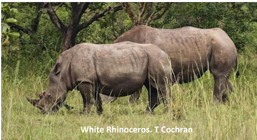
White Rhinoceros. T Cochran

After breakfast, we will spend some time tracking Southern White Rhinoceros in a reserve that is home to the only wild population in Uganda. This is an amazing chance to see these animals at close range and learn about the amazing efforts to conserve and breed them. The entry fee contributes directly to the maintenance expenses of this conservation program. The sanctuary is also home to 340 bird species, including Bronze-tailed, Ruppell's and Purple-headed Starling, Bruce's and African Green Pigeons, Northern Crombec African