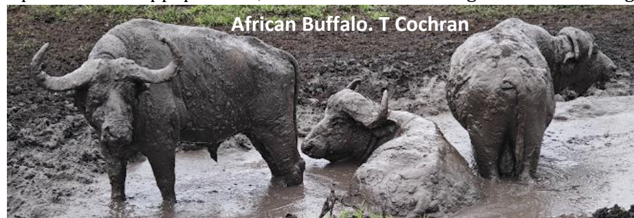
African Buffalo.

Day 8. Kibale to Queen Elizabeth National Park. After breakfast, we will travel to Queen Elizabeth National Park. The Park, which is named after the Queen of England who visited it in 1954, is the second largest national park in Uganda. Queen Elizabeth National Park boasts the highest biodiversity of any game reserve in the world and the habitat is comprised of a mix of open savannah, rainforest, dense papyrus swamps, crater lakes and the vast Lake Edward. Queen Elizabeth National Park is home to almost 100 mammal species and a remarkable 612 bird species, making it a superb safari territory, with Bush Elephants, a profusion of Hippopotamus, elusive Giant Forest Hog and handsome Uganda Kob all regularly sighted