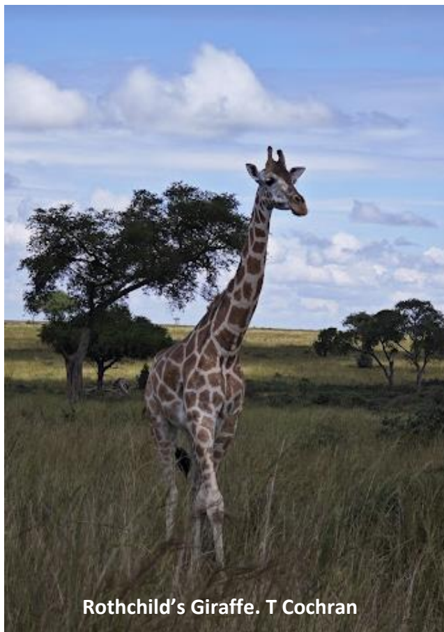
Rothchild's Giraffe. T Cochran

Day 5. Murchison Falls to Masindi. After breakfast we shall cross the Murchison River and drive to Masindi through the escarpment. We shall also pass through a section of Budongo Forest Reserve which is a good location for species such as the Rufous-crowned Eremomela, Chocolate-backed Kingfisher, Ituri Batis, Puvell's Illadopsis, Lemon-bellied Crombec, White-thighed Hornbill and many more. Accommodation: Hotel in Masindi (en suite rooms). Meals: B, L, D.